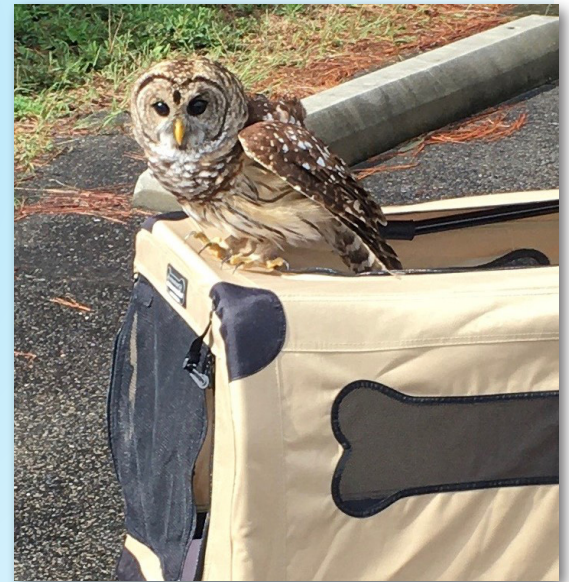
Barred Owl Release